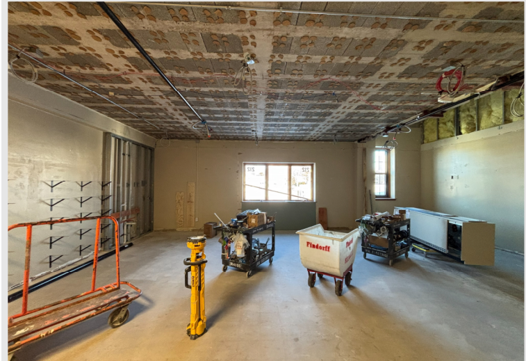
Overhead rough-ins nearly complete in the Second-Floor 3<sup>rd</sup> Grade Classroom. This space is ready for drywall and finishes starting soon!