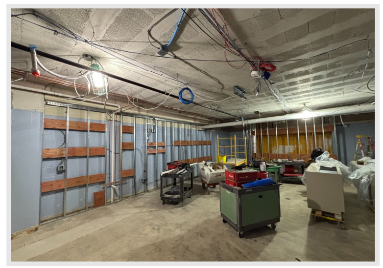
Wall framing, rough-ins, and blocking in place in the Lower-Level OT/PT Room. Overhead MEPF rough-ins are moving along!